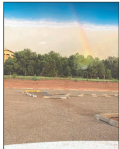
God is watching over all of us in our "arc" & giving us the strength to build, worship & flourish.