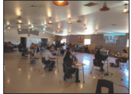
Our Teachers Soaking In the Conference