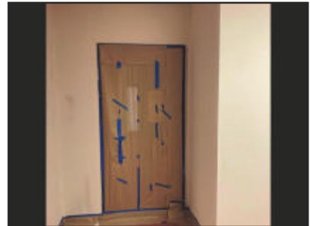
Preparing To Paint